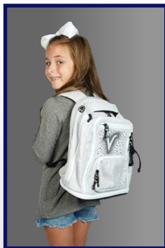
CheerVille Rebel Mini Dream Bag (optional)